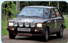
2012/2013: Poul og Egon Brøndum, Toyota Starlet